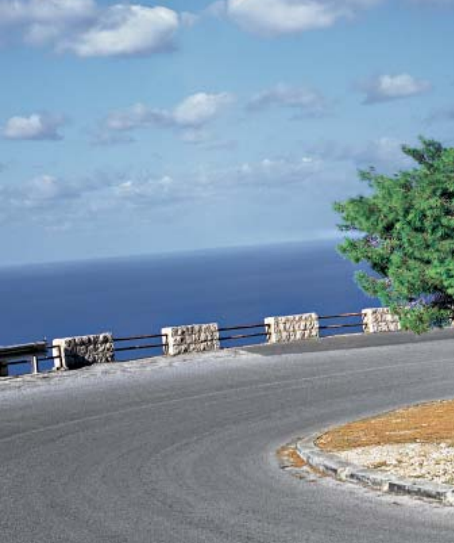
The road is dry, so most of the power is sent to the rear axle for good traction and that typical BMW driving feel.