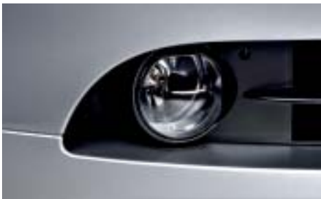
Illustration shown with European bumper. All U.S. 5 Series Sedans are equipped with provisions on the front bumpers for headlight washers, which are included in the optional Cold Weather Package.

■ Halogen free-form foglights , integrated into the deep front spoiler, enhance your margin of safety in bad visibility. Ellipsoid free-form technology ensures even light distribution on the road.