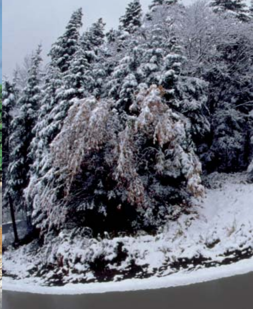
xDrive detects snow under the rear tires. For optimal traction, the clutch plate transfers more power to the front wheels.