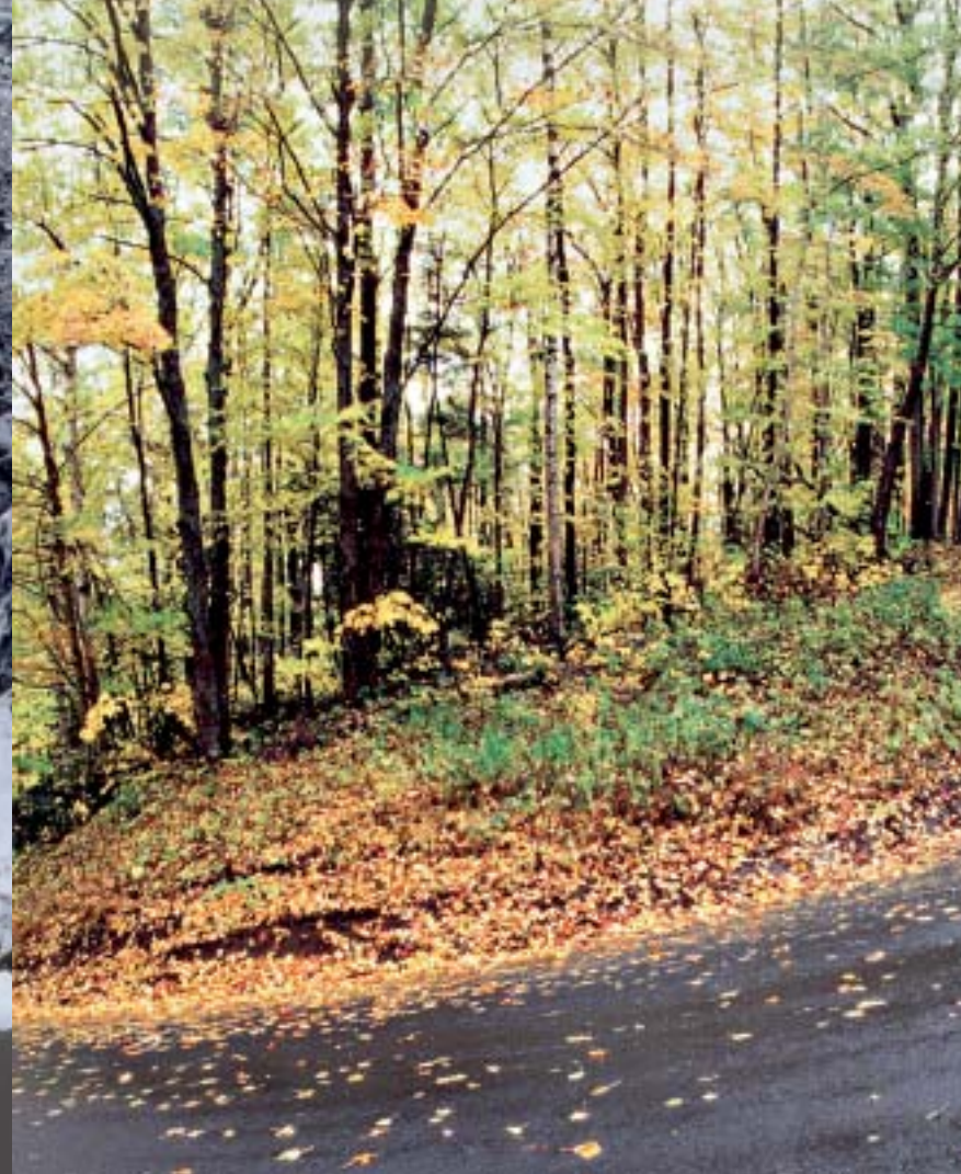
The front tires drive over slippery leaves. In split seconds, the clutch plate opens, sending all available power to the rear axle.