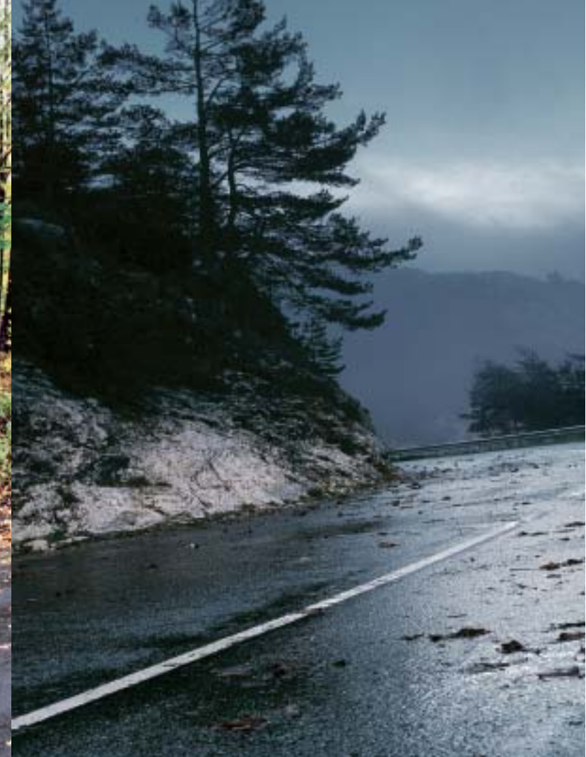
The road is covered in water. As all the wheels reach the wet asphalt, xDrive, sensing wheelspin, sends sufficient traction to appropriate wheels to help maintain stability.